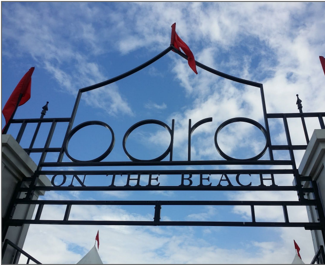
Pictured above is the recently remodelled Bard on the Beach logo at the theatre's entrance.

White tents towered over me as I was pushed in with a crowd. As I entered, I sensed a feeling that only exists in a place that's had its years. Established in 1990, Bard on the Beach has upheld a high reputation, setting the bar high for non-profit theatre. As I walked through winding tunnels and thin metal structures, I couldn't help but wonder, 'this is a theatre?' I had been here before but the excitement and curiosity was constant. I walked up some stairs as I looked for my seat: section 4, row F, seat 38. Then I found it. As I sat down and glanced up, the view of the ocean landscape of Vancouver captured my attention instantly.